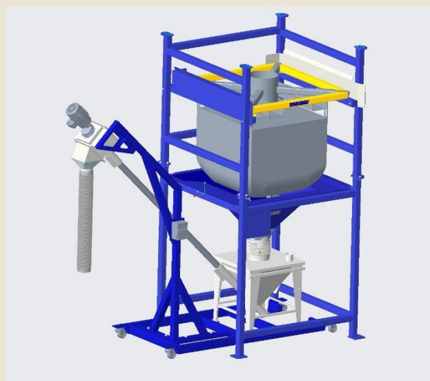
Figure 2: Portable Additive Induction System