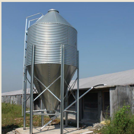
Figure 1: Permanent Additive Induction System

It is simple to implement JavaLube™ into a preexisting facility. All that is needed is an additive induction system with a micro feeder to feed the material and a conditioner or mixer to blend the material. Once an implementation system is installed, the material metering can be tied into the overall controls, or a separate control panel can be installed to adjust the pellet composition.